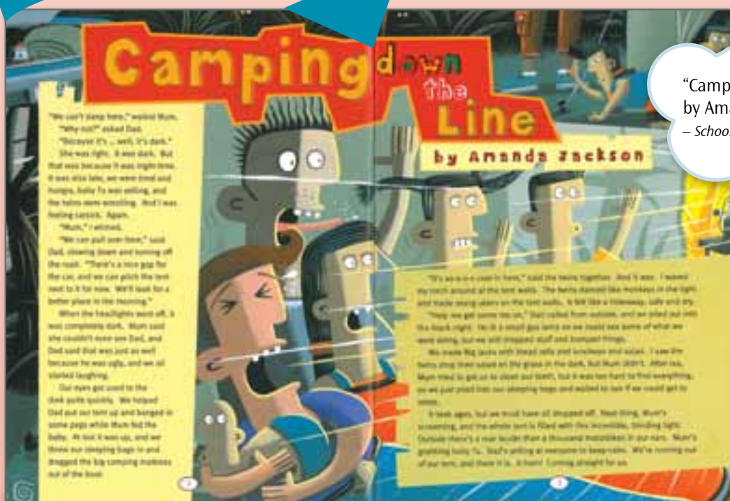
"Camping down the Line" by Amanda Jackson — School Journal, Part 2 Number 1, 2004

Copyright for the text, illustrations and/or photographs is as stated in the original publication.